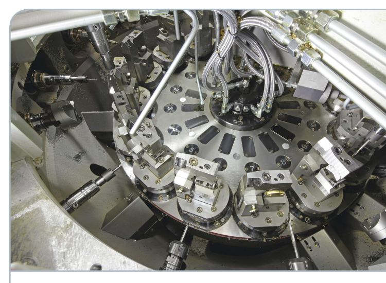
:: Indexing chucks on the Epic R/T machine enable fivesided machining of about 25 different lock body sizes with little to no adjustment from one size to another.

In 1973, while studying law, he was offered a job in the accounting department at the company. Later, he continued his education while working and received