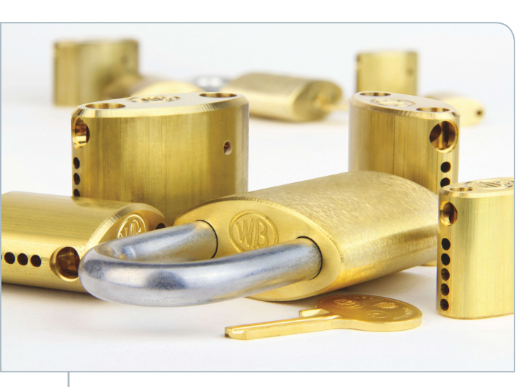
:: A complete lock is photographed in the center of the different parts for padlocks that pass through Wilson Bohannan's manufacturing cell.

Previously, barstock was placed on tables and hand fed into a manually operated saw that cut lock body blanks to length.