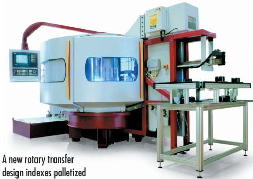
A new rotary transfer design indexes palletized workpieces across eight or ten machining modules. Each module can be configured with automatic tool changers.

The pallet system on the AT uses the Erowa modular power chuck for accurate location of the pallets. With this system workpieces are mounted on a pallet that is transferable from one receiver to another, around the periphery of the rotary table. This power chuck system uses a Hirth coupling ring to locate each pallet in its receiver. Clamping pressure is 2,033 pounds (9,000 N). The Hirth ring gives location accuracy and repeatability of 2 microns or less.